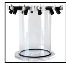
Vertical Drum Manifold