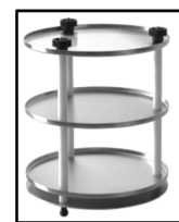
Bulk Shelf Rack